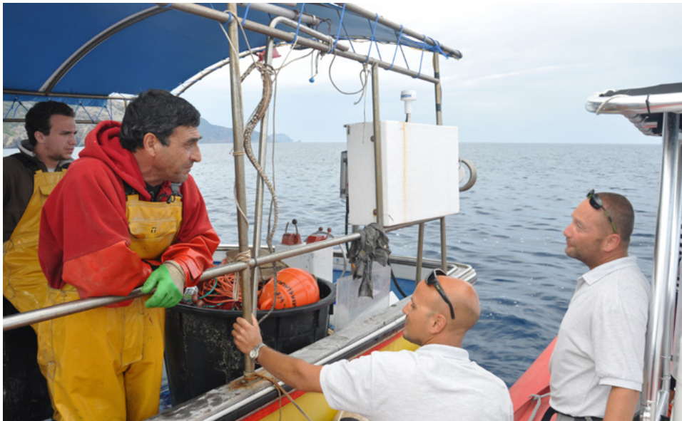
Fishermen collaborate with Marine Protected Area authorities in Scandola, France

Marine protected area managers and fishers need to realise that both groups must work together if they are to attain their common ultimate aim: the conservation of healthy, productive and plentiful seas for securing the future of nature and the well-being of coastal communities.