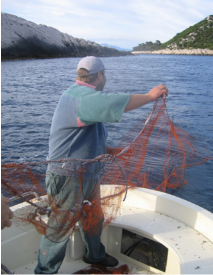
Fisher in Lastovo, Croatia

to self-regulate fishing activities within this social group. These self-established regulations may include fishing gears, quotas, seasons, targets and restricted areas (such as voluntary fisheries reserves and cantonnements de pêche in France). Further to local and national initiatives, the recently set up Mediterranean Platform of Artisanal Fishers, with a regional membership and scope, now provides a united and stronger voice for small scale fisheries, namely at the level of the GFCM, the FAO and the EU (MedArtNet, 2014).