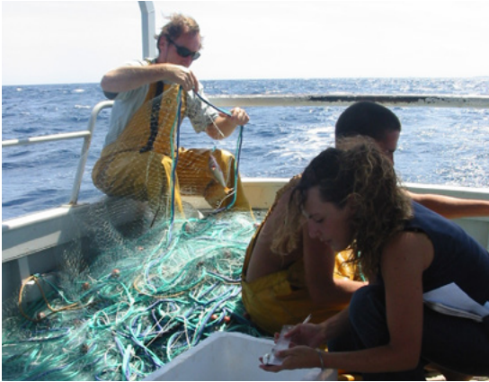
Fishermen collaborate with Marine Protected Area authorities in the Bonifacio Strait Nature Reserve, France