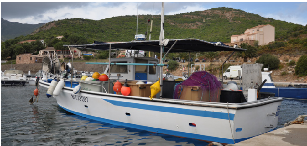
Artisanal fishing boat in Galeria, France