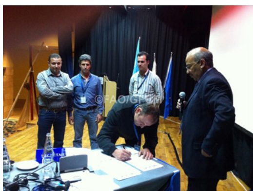
Signature of an agreement between northern and southern fishermen at the GFCM symposium on artisanal fishing

A number of issues are worth considering when looking at Mediterranean artisanal fisheries from the fishers' perspective: strengthening fishers' stakeholder position, reducing their environmental impacts, focusing on quality and direct commercialisation of landings, adapting and profiting from new business opportunities, and guaranteeing adequate revenues and replacement of crews to ensure an enduring future. We will look at these issues in more detail.