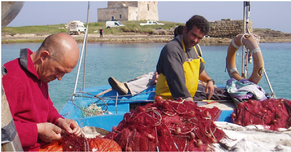
Artisanal fishers in Torre Guaceto MPA, Italy