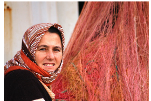
Women involved with fishing in Turkey

Some of the environmentally positive aspects of artisanal fisheries when compared with industrial fisheries have to do with the lower volume of catches and the wider range of target species (5.5% of the world's marine fauna globally; Battaglia et al. , 2010), which reduces impact on the composition of biological communities when compared with the same volume of catches from a lower number of species. Some positive economic aspects lie on the following facts: artisanal fisheries are not generally subject to fishing quotas; they usually occur throughout the whole year (by seasonally adapting gears to different target species) resulting in continuous revenues; they do not rely on subsidies as frequently as several industrial fisheries do; and they are less dependent on oil prices and external markets to sell their products. Finally, there are a number of common characteristics about artisanal fisheries that make them also more socially sustainable than their industrial counterparts: they normally take place using owner-operated vessels thus reducing job conflicts; they involve shorter trips (of usually one day or less) making the occupation more tolerable and family-friendly; and they engage substantial numbers of members from coastal communities sharing economic, social and cultural interests.