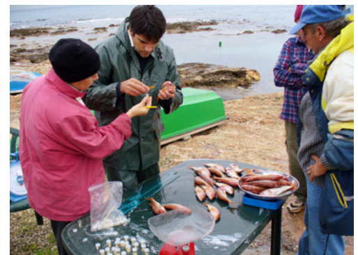
Scientists and fishermen study red striped mullet caught outside Torre Guaceto marine reserve, Italy.

The recovery of fish stocks following a temporary or long-term closure and the spill-over effect this may result in have been key arguments to overcome fisher's initial scepticism. Formal and informal discussion