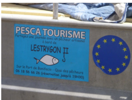
Pescatourism boat in Bonifacio, France

Some artisanal fishers are failing to diversify and profit from complementary sources of income from new sea-related activities such as fishing tourism or wildlife watching. Some complain about the limited space and the costly safety modifications needed to carry tourists on board that regulations impose. Some do not like to modify their customs and traditions. Nevertheless, in many cases the