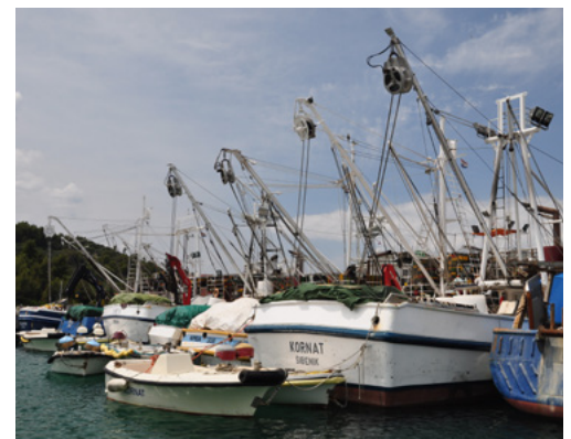
Fishing harbour of Korcula, Croatia

Artisanal fisheries provide critical income and edible protein to hundreds of millions and contribute to poverty alleviation and sustainable development in many coastal areas of the world. Artisanal fishers operate in some of the biologically richest and most sensitive waters of the planet, where interactions with coastal and marine activities introduce complex interdependencies. Conflicts between artisanal fishers over fishing rights are common everywhere. So are conflicts between artisanal fishers and industrial fishers, their main competitors, over fishing rights, piracy, over-exploitation of resources by highly efficient industrial vessels, and damage to artisanal fishing gears (mainly static) by towed gears from industrial vessels. These conflicts are more common and more serious in developing countries with limited capacity to police their waters. They are a difficult management problem as stakeholders' views and interests are often mutually exclusive. Artisanal fishers' rights risk being overshadowed by those of the fishing industry, usually a much more powerful actor in terms of economic input and political influence. Conflicts are also common between fishers and conservationists, managers and policy makers when it comes to designating new marine protected areas or modifying ( i.e. restricting) fishing rights in existing marine protected areas. Due to fishers' enormous influence on the conservation status of